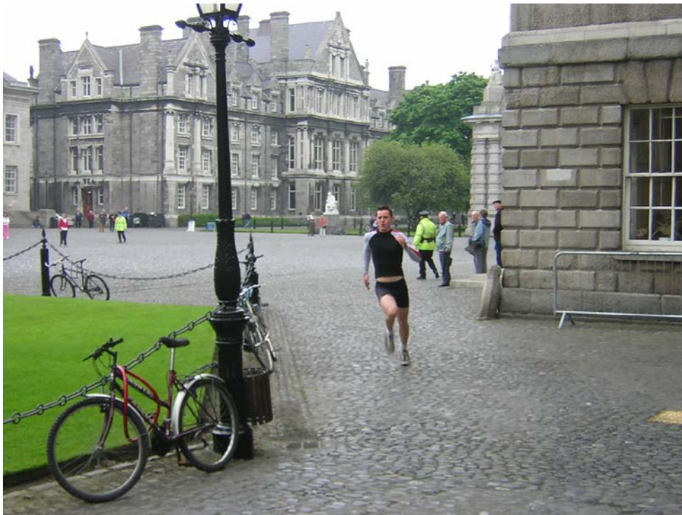
'Chariots of Fire' College Dash. Competitor running between the corner of the Public Theatre and the lawn outside Houses 1-5.