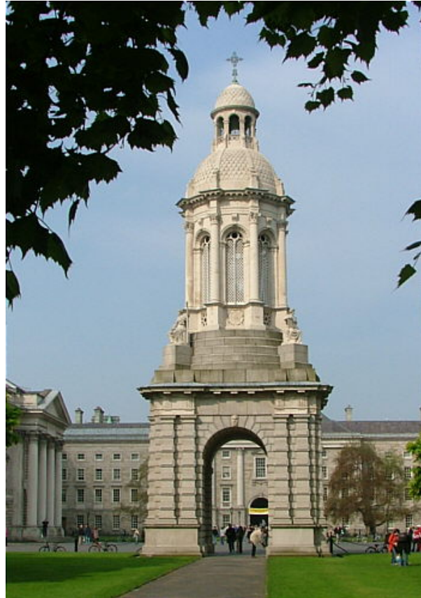
The Campanile viewed from the Rubrics, Trinity College Dublin

The course, except for the initial part through Library Square, is run on stone setts throughout. Each of the heats is started by a shot from a starting pistol and hand-timed. The fastest four men and women from the heats contest semi-finals. The winners of the semi-finals run in the finals. One final is run at 11.50 a.m. and the other at 12 noon.