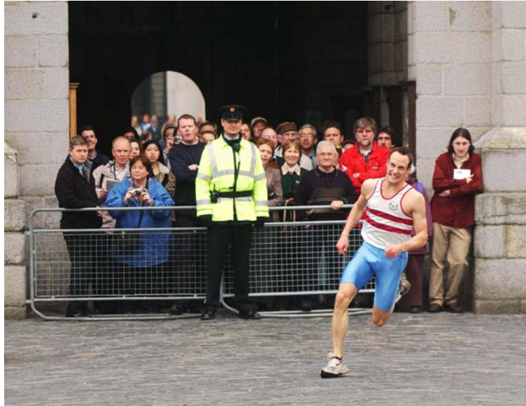
'Chariots of Fire' race. Rounding the final corner at Regent House, Front Arch, for the straight run to the finish line at the Campanile

One athlete runs past the Public Theatre and around the side of the lawn beside houses 1 – 5. The other athlete runs past the College Chapel and around the lawn beside houses 6 – 10. They meet again at Front Arch, Regent House, proceeding up the central path from Regent House across Parliament Square to the finish line at the Campanile.