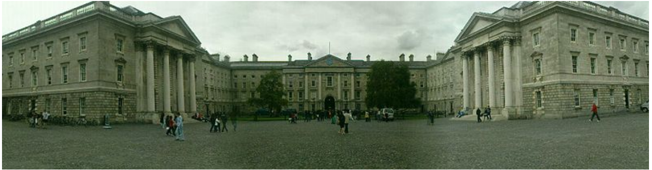
Panoramic view of Parliament Square from the Campanile, Trinity College Dublin. On the left in the Public Theatre (commonly referred to as the Examination Hall) and on the right is the College Chapel. Straight ahead is Regent House.

The race is run by students in pairs starting at the Rubrics. Each competitor must have one foot in contact with the wall of House 24. The competitors run up the central path of Library Square under the Campanile and then split to take each side of Parliament Square. Sides are drawn by lot.