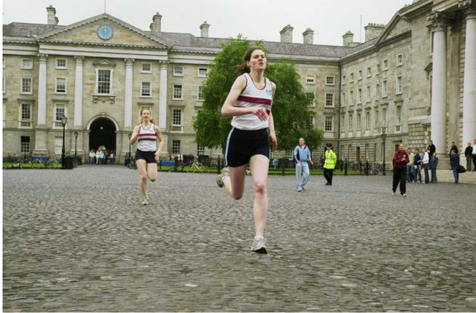
Final sprint to the finish line of the 'Chariots of Fire' dash across the square sets of Parliament square.