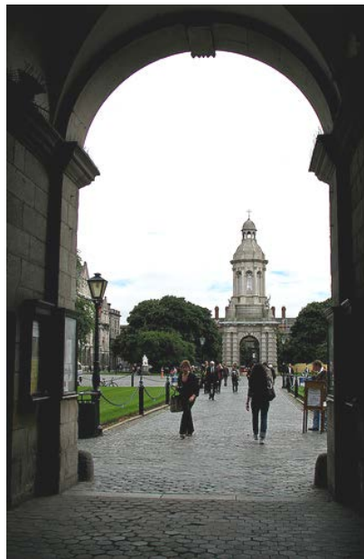
Competitor's view from Regent House up central path of Parliament Square towards the Campanile, the finish line of the 'Chariots of Fire' College Dash.