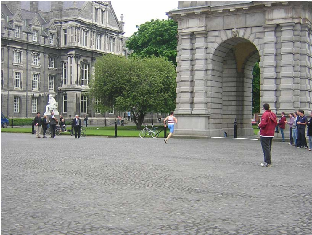
'Chariots of Fire' race. Competitor approaches the finish line.